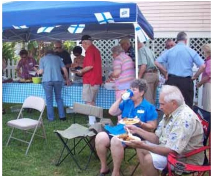
East Enders enjoying Galveston Summer.