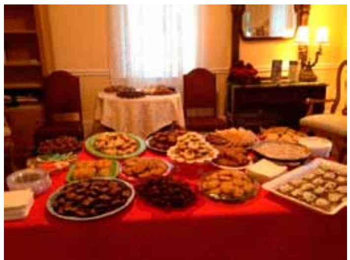
Volunteers prepared an array of holiday treats for Homes Tour visitors to The Cottage.