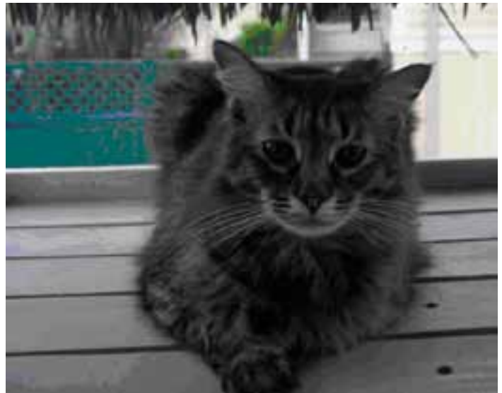
Our first Pets of the Month, Emily Ann, above, and Dorothy Dan, right.